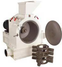
Hammermill Milling & Pulverizing